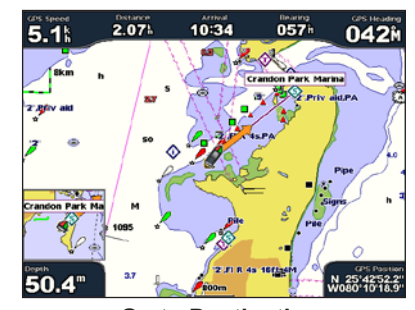
Go to Destination