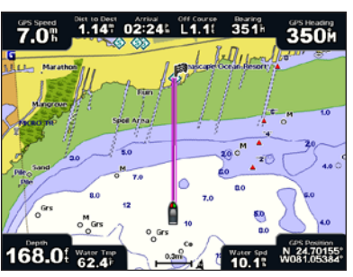
Go to Destination