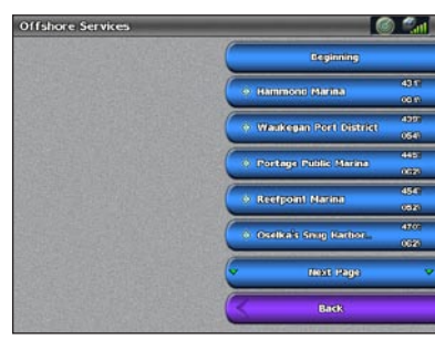
List of Marine Service Items