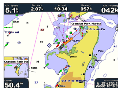
Go to Destination