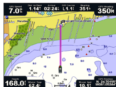
Go to Destination