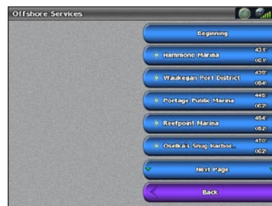
List of Marine Service Items