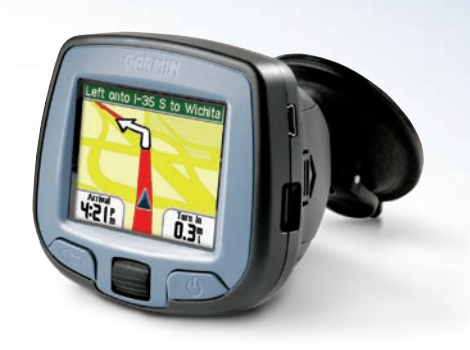
StreetPilot i3 shown