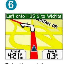
Enjoy the route!

Tip: To narrow your search, select the <Spell> field and enter letters in the name of the place.