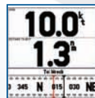
Big Numbers Option

Data cartridges provide optional MapSource data for enhanced map detail