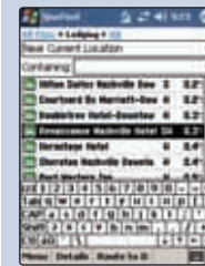
Look up points of interest