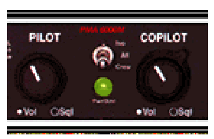
Figure 3 Volume Controls Mono

The pilot volume control knob adjusts the loudness of intercom and music in the pilot's headphones only. It has no effect on selected radio audio levels. The copilot volume control adjusts the loudness of the intercom and music in the copilot headset only. The passenger volume is factory set at a comfortable level. This is a service adjustment that can be